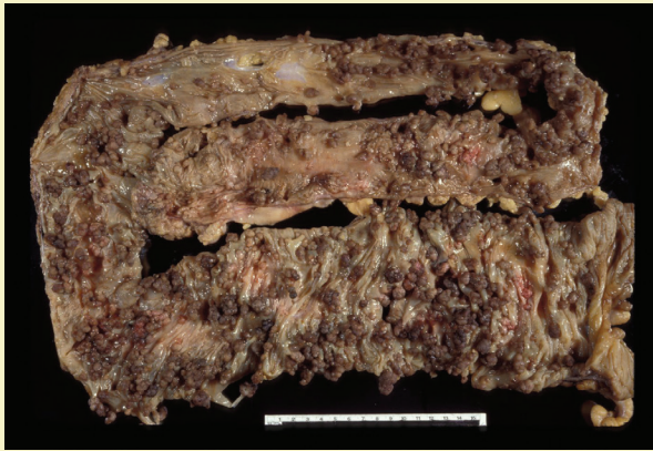
FIGURE 2. SURGICALLY RESECTED BOWEL WITH POLYPS

Note. This surgically resected bowel shows a "carpet of polyps," which is typically seen in familial adenomatous polyposis.