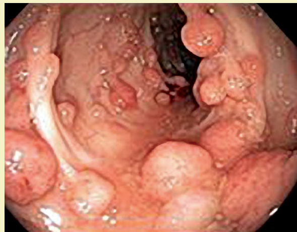
FIGURE 4. BOWEL ENDOSCOPY WITH POLYPS

Note. This bowel endoscopy shows polyps that are typically seen in familial adenomatous polyposis.