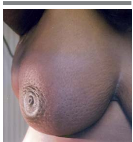
Note. This photo reveals the clinical characteristics of inflammatory breast cancer: erythema, edema, nipple flattening, and peau d'orange .

Inflammatory breast cancer is not associated with a particular histologic subtype (Giordano & Hortobagyi, 2003); however, it has distinct biologic characteristics that differentiate it from noninflammatory breast cancer. These tumors typically are high grade, aneuploid, and hormone receptor negative (Charafe-Jauffret et al., 2004; Giordano & Hortobagyi). Mutations in the p53 gene also are more likely to be present (Turpin et al., 2002). Overexpression of HER2/neu, epidermal growth factor receptors, and cathepsin D generally are present (Charafe-Jauffret et al.). Turpin et al. studied 161 patients with inflammatory breast cancer and found that HER2/neu overexpression was twice as frequent in inflammatory breast cancer as in noninflammatory tumors. In their retrospective chart analysis, Charafe-Jauffret et al. found that, along with three other variables (i.e., estrogen receptor negativity, MIB1 > 20, and mucin 1 cytoplasmic staining), HER2/neu