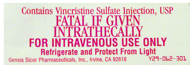
Figure 3. Example of Syringe Label That Is Affixed to Prepared Doses of Vincristine

In developing an institutional policy for intrathecal chemotherapy administration, several concepts warrant inclusion. First, chemotherapy of any kind should be given only