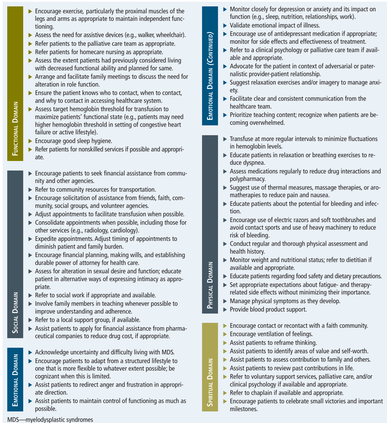
FIGURE 4. Nursing Interventions to Maximize Quality of Life According to Domain

The financial strain from treatment can be significant for patients with MDS. A Cancer Support Community (2010) study found that 81% of patients experienced moderate to severe stress levels from monetary burdens associated with cancer care. Those findings were corroborated in Canada where a "sizeable minority of cancer patients find the burden of out-of-pocket costs to be significant or unmanageable, even in a healthcare environment where much of the care falls within the public funding envelope" (Longo, Fitch, Deber, &